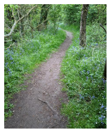
Bluebells in the Spring

The Coombes woodland is a rare area of ancient woodland in Wokingham Borough and has been enjoyed by local residents for many years. When the property was put on the market the Parish Councils decided they had to act to ensure that the woodland remained accessible to the public for the rest of time. Using Community Infrastructure Levy (CIL) money received from developers building homes across the parishes enabled the councils to purchase the woodland without financial