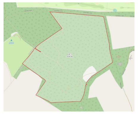
The plot of The Coombes owned by the parishes

In a landmark collaborative effort, Barkham Parish Council and Arborfield and Newland Parish Council proudly announce the joint acquisition of 60 acres of The Coombes ancient woodland that sits along the boundary between the two parishes. This initiative will ensure that The Coombes remains open to the public to enjoy in perpetuity and will enable the parishes to take further steps to improve bio-diversity in the area.